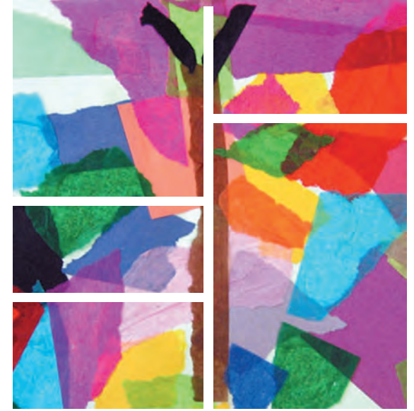
Art by Bobbi, age 14