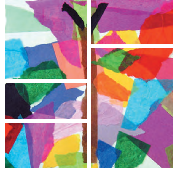
Art by Bobbi, age 14